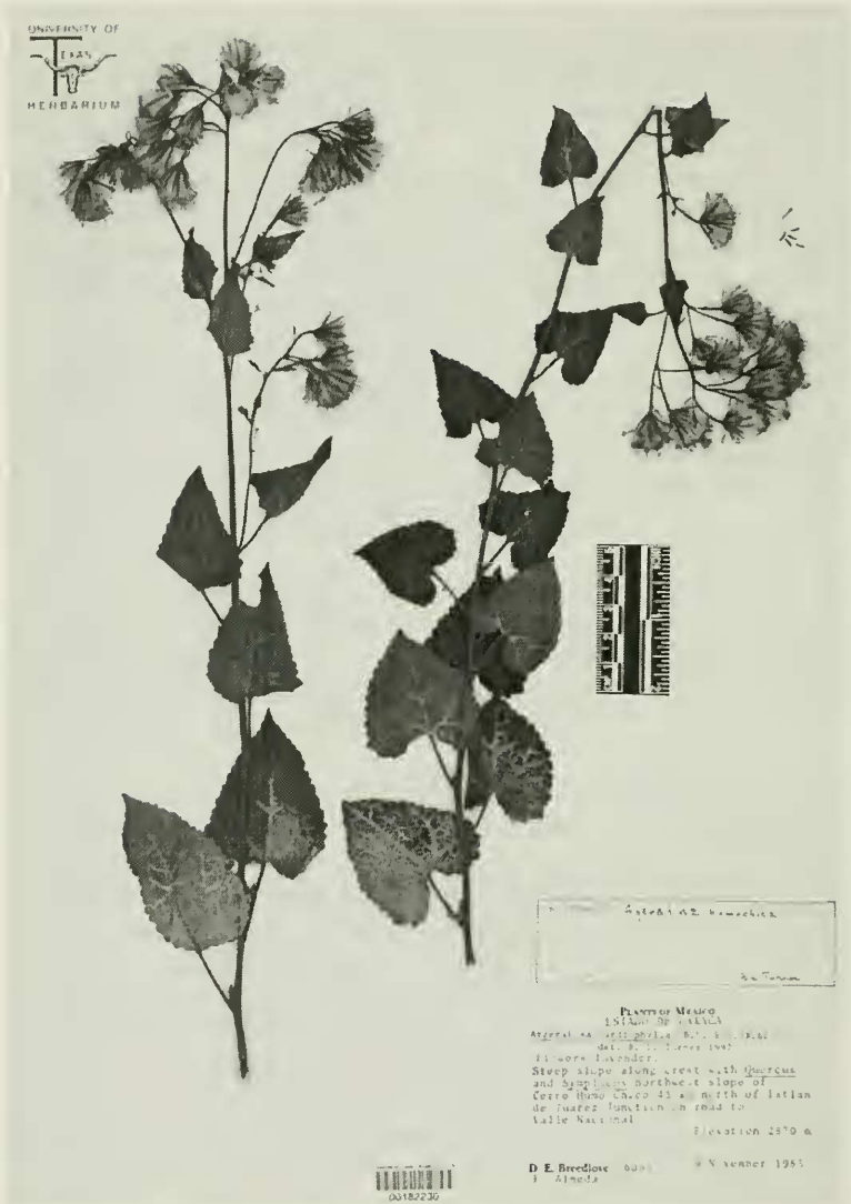
Fig. 1. Ageratina humochica (Holotype).